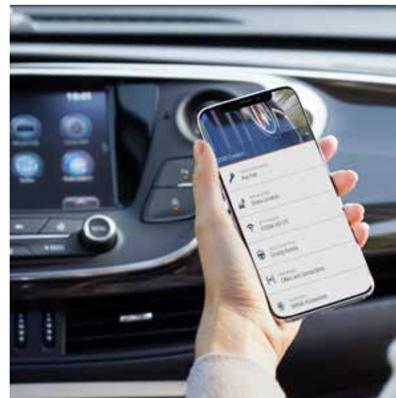
U.S. model shown. Features shown may not be available in Canada.

WIRELESS SMARTPHONE CHARGING 6 Cut the cord with the help of available wireless charging for compatible smartphones on select Buick models.