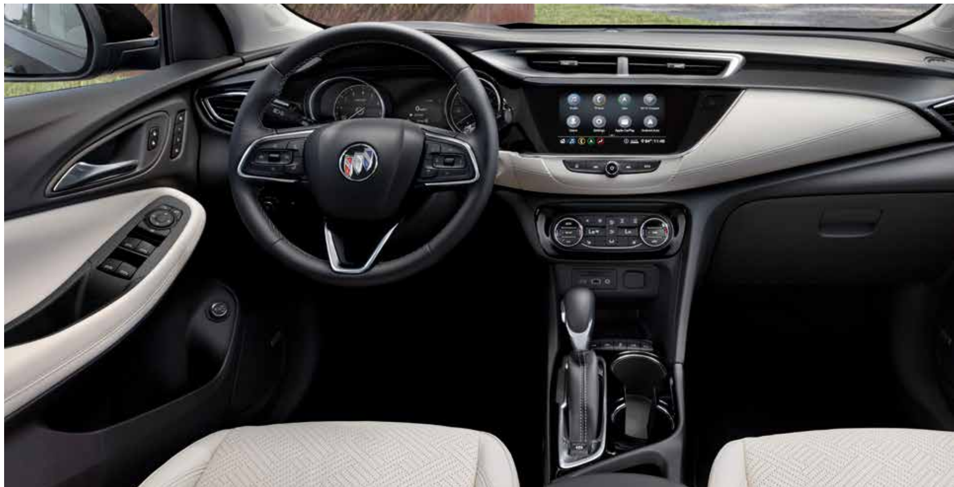
U.S. model shown. Encore GX Essence interior shown in Whisper Beige with Ebony accents and available features.