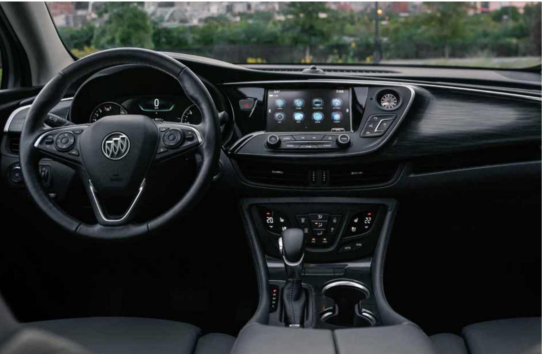
Envision Premium II interior shown in Dark Galvanized with Ebony accents and available features.