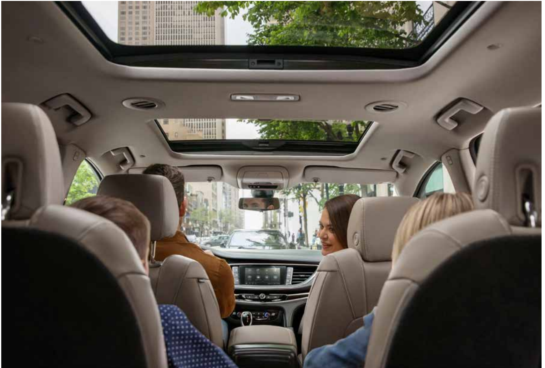
Enclave Premium interior shown in Shale with Ebony accents and available features.