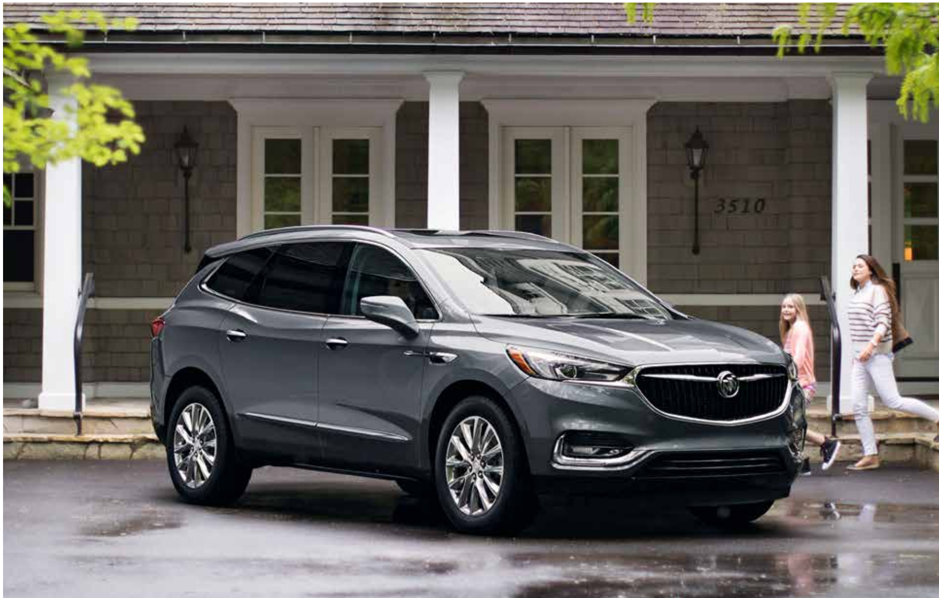
Enclave Premium shown in Satin Steel Metallic (additional charge; premium paint) with available features.