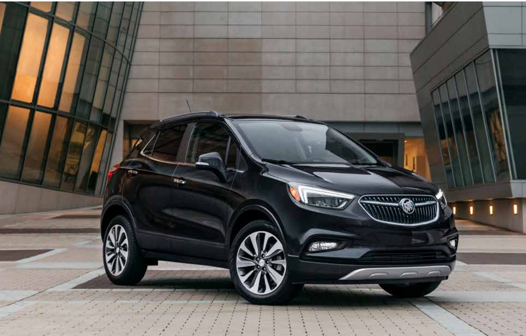
Encore Essence shown in Ebony Twilight Metallic (additional charge; premium paint) with available features.