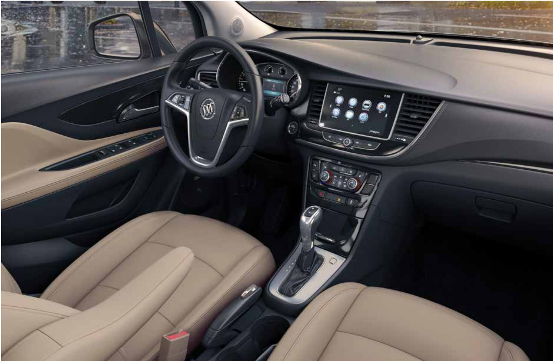
Encore Essence interior shown in Shale with available features.