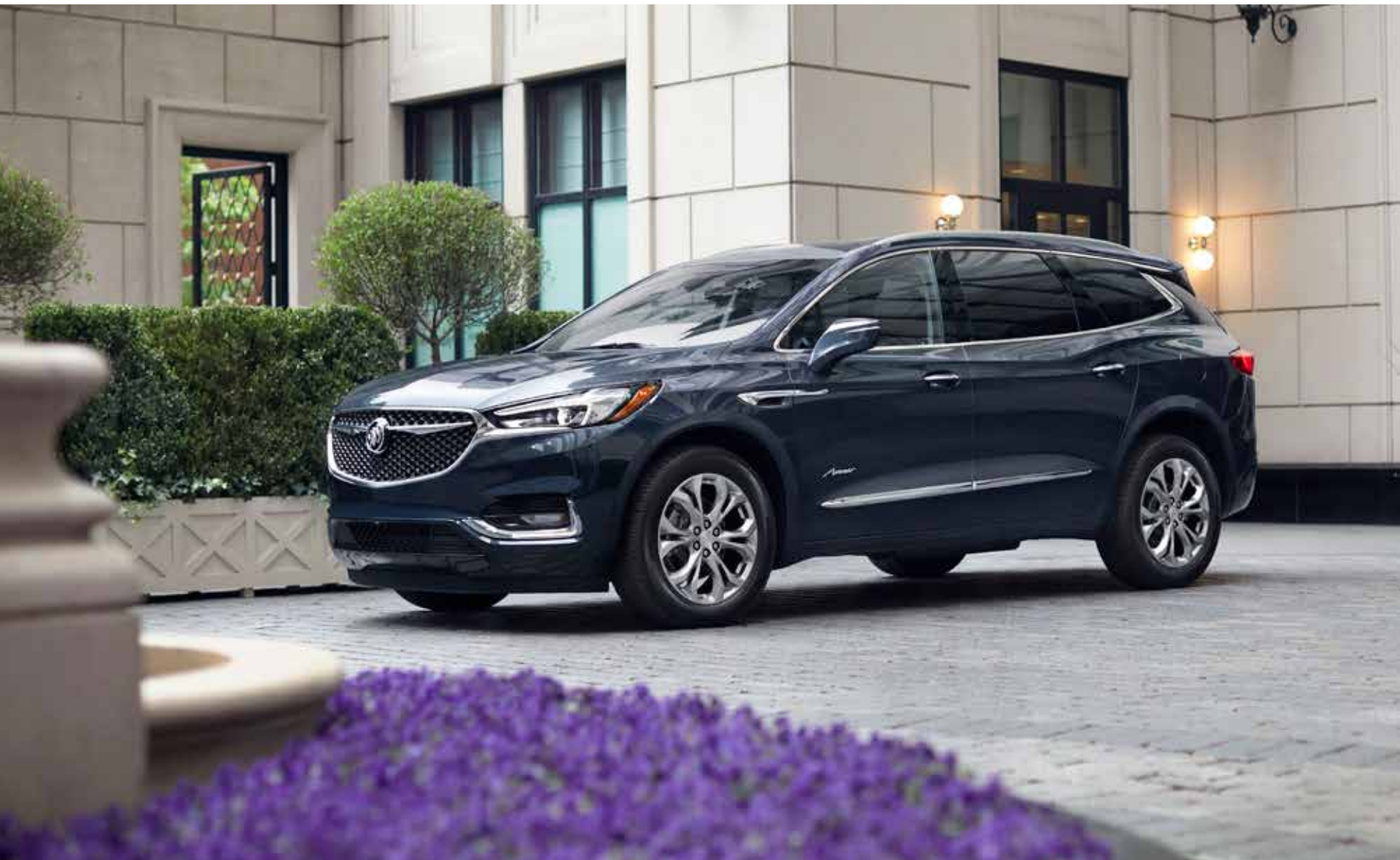
Enclave Avenir shown in Dark Slate Metallic with available features.