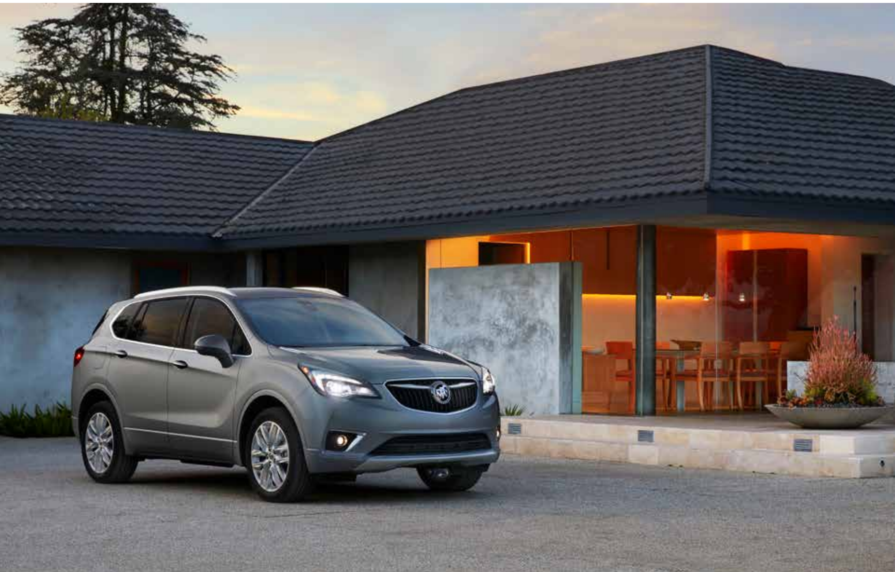
Envision Premium II shown in Satin Steel Metallic (additional charge; premium paint) with available features.